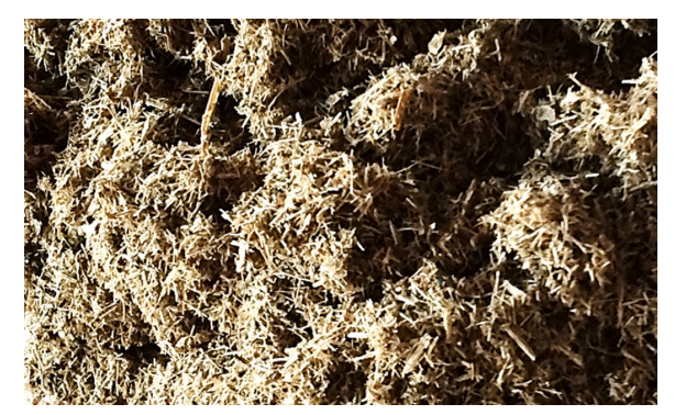
NUFIBER 3X BEFORE ABOSRPTION